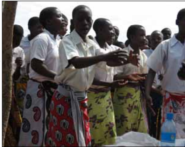
Kinyika students celebrating WED