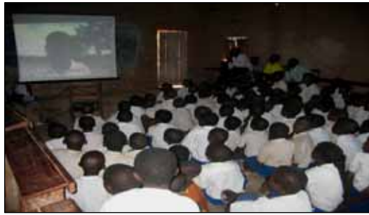
Matalawe students watching Maji ni Uhai

At the village film shows, FORS and the village chairperson started by welcoming all villagers to the show, followed by a presentation about FORS and its activities. Then we