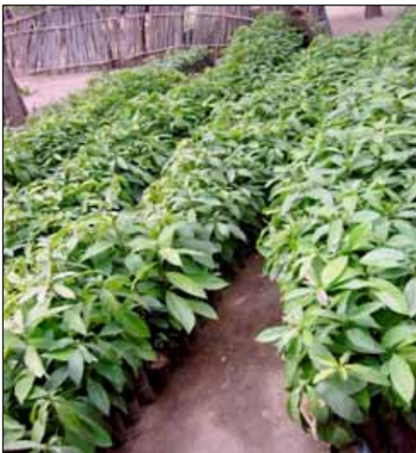
Nursery with fruit tree seedlings

FORS would like to congratulate these three schools for their efforts of planting tree seedlings as shown below. This year they have succeeded in germinating more than 1500 tree seedlings of different species.