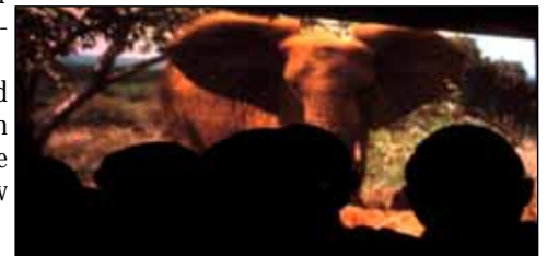
Children from Mlowa enjoying 'Elephants of Tsavo'