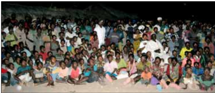
Idodi villagers gathered for an evening of films projected onto the side of the local post office