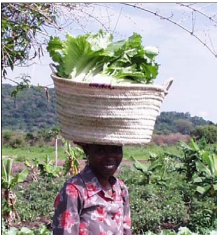
Who is the lady with the lettuce?

We went on a trip to visit the vegetable growers. We picked our way over fields until we suddenly stopped, arrested by an unusual sight – courgettes! In the next plot we spotted basil, and a bit further on were some lettuces and leeks. All very odd in rural Tanzania, but proof that